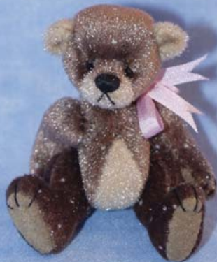
Balfour 2 in