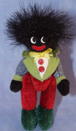
Bobbie Golly 3 in