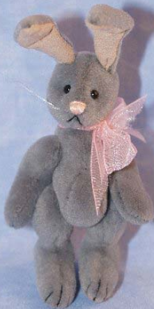
Chalky Rabbit 3 in