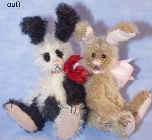
Smudge and Lopsy le 65 3 in (almost sold out)