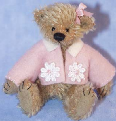
Pamela 3.75 in le 100