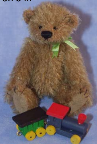
Whistle le 100 3.75 in