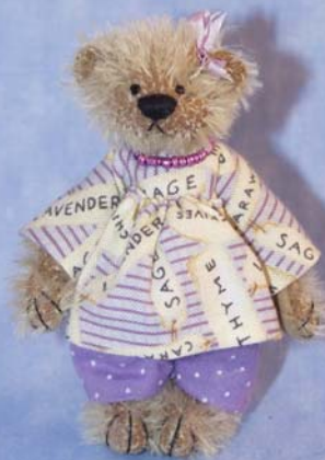
Lavender 3.75 in le 100