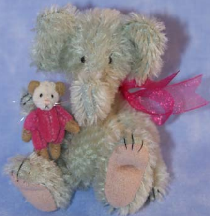
Tic & Tac le 100 3.75 in