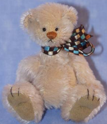
Apricot 3.75 in le 65 almost sold out