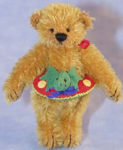
Whistle 3.75 in le 100