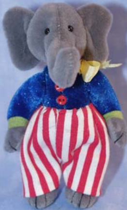
Aesop Elephant 3 inches