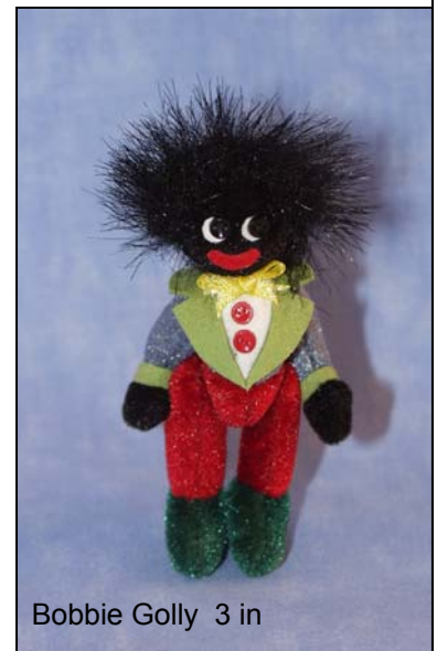
Bobbie Golly 3 in

We have some fun new pieces releasing this week. On the following pages you will also find some pictures of the pieces that were released in February. I got a little behind due to being away at trade shows.