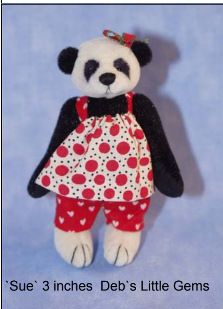
`Sue` 3 inches Deb`s Little Gems

We have some fun new pieces releasing this week. On the following pages you will also find some pictures of the pieces that were released in February. I got a little behind due to being away at trade shows.