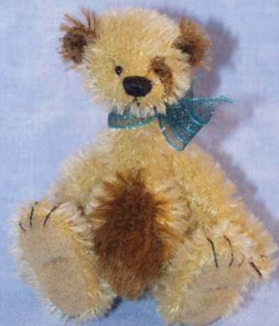
Shelley 3.75 in le 70 close to sold out