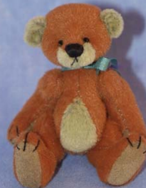
Benson 2 in