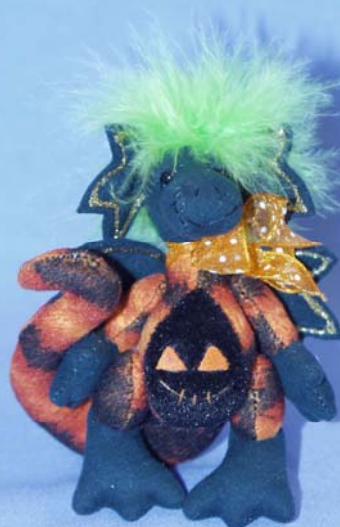
~Hocus Pocus~ a Dappled Dragon le 125 3.75 in