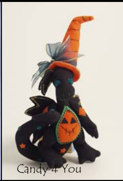
Candy 4 You