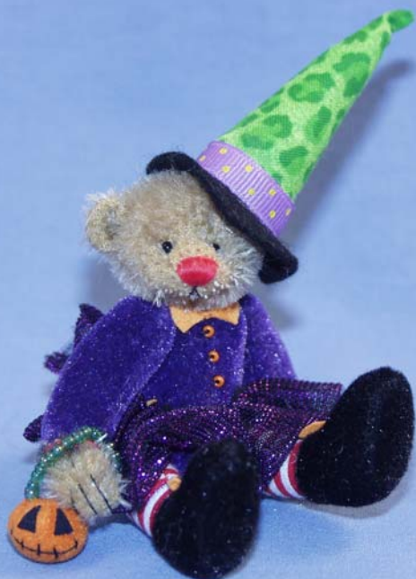
~Sabrina~ 3.75 in—I love these Halloween witches Le 150