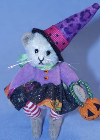
~Tabitha Mouse~ 2.75 inches l;e 150

This years ~Halloween~ is very confusing because there are these designs for the regular line available to everyone and then there are the 2007