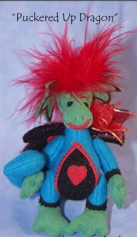
LE 75 3.75 inches wool/ultrasuede