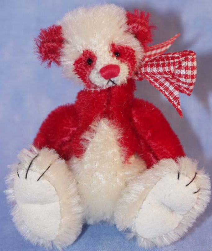
LE 50 3.75 inches Mohair