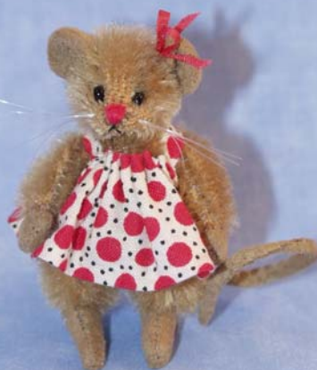
LE of 70 2.5 inches Mohair