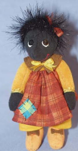
Gabbi 3.75 in le 75