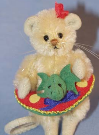
Paddle 2.5 in le 75