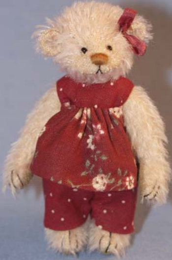
Sarah Jane 3.75 inches