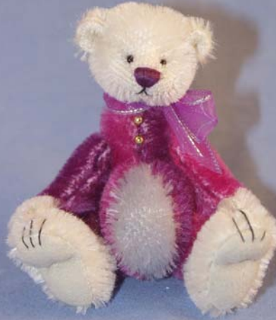
Raz 3.75 inches