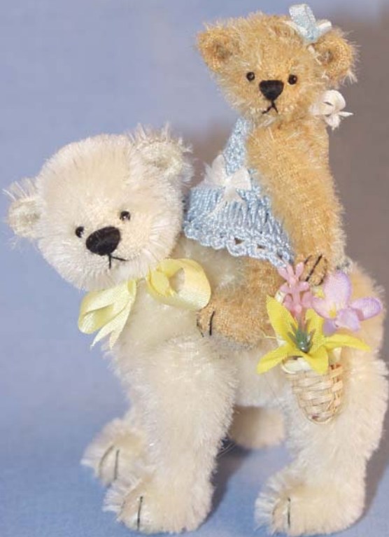
Mint Julep bears 3 inches