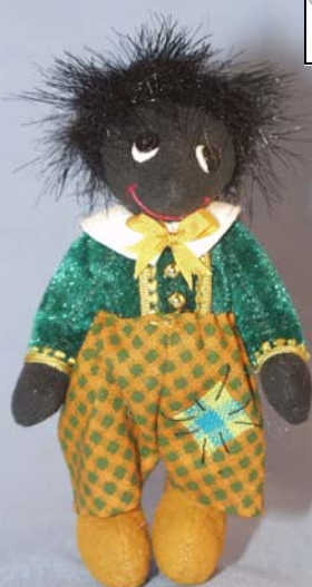
George 3.75 in le 75