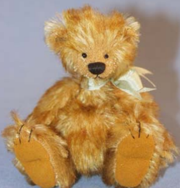
Tiffin 3.75 le 40