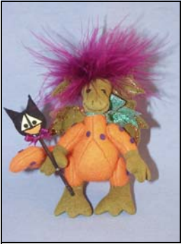
Boo Boo Dragon