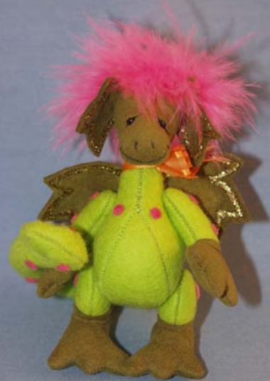
Midsummer le 100