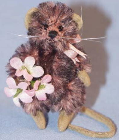
Petals Mouse 2.5 inches