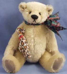
Hamish 7 in le 64