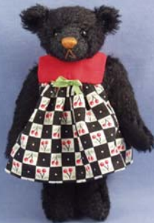
Estelle 5 in le 100