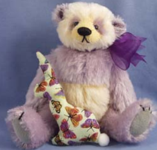
Lou Lou 7 in le 100