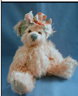
exander 4 in le 100