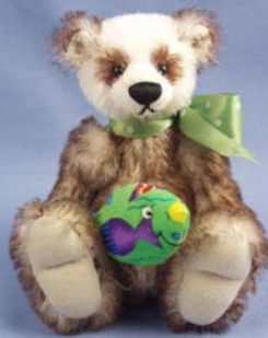
Brownie 5.5 in le 100