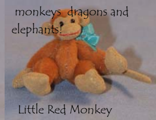
Little Red Monkey