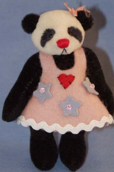
Nihao le 100 3.25 in