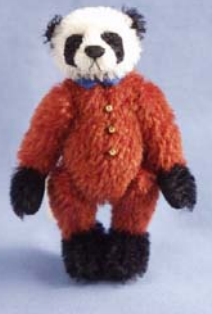
Barnaby 4 in le 100