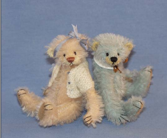
These two 3.75 in bears have contrasting muzzles and inside ears. ' Perry ' is a light Aqua color, has a white color and tan silk bow. ' Peachy ' is made from a Peach colored mohair. she has a little white cardigan and a blue silk bow. They are both limited to 70.