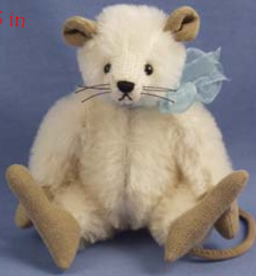
Ping Wing 5 in le 125