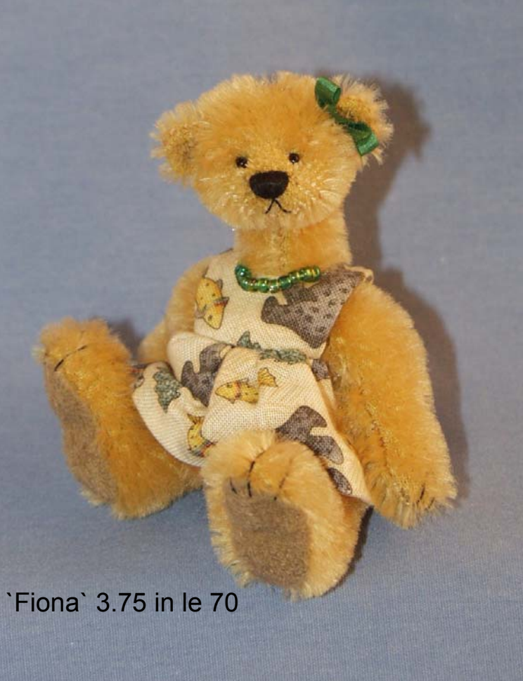
' Fiona ' 3.75 in le 70