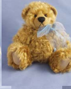
Sudbury 80 7in