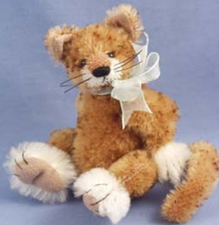
Mabel 5 in le 100