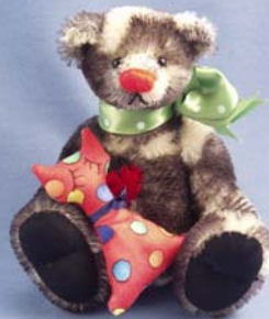
Inky 5 in le 100