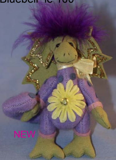
Bluebell le 100

Convention 15,16 & 17 October 2010—Tampa Airport Marriott Tampa Airport, Florida