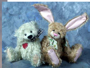
Sweetpea and Hoppy 14 inches