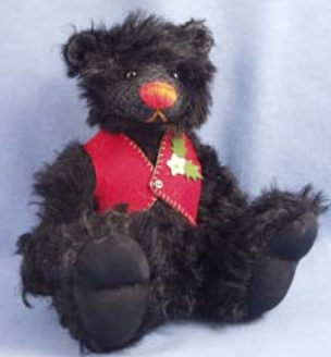
Buzz 7 in le 100